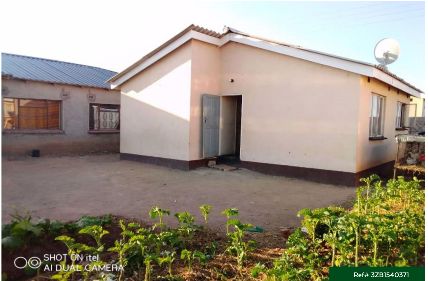
Nehosho Housing Scheme Core House